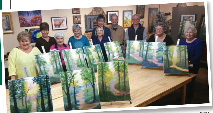
Oil painting class at the Art House, February 2016