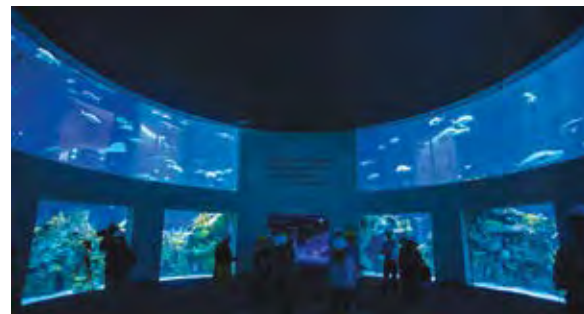
300,000-gallon wraparound aquarium

Includes: Motor coach transportation, admission to the museum and aquarium, lunch, dinner and all tips/gratuities.