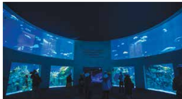
300,000-gallon wraparound aquarium

Includes: Motor coach transportation, admission to the museum and aquarium, lunch, dinner and all tips/gratuities.